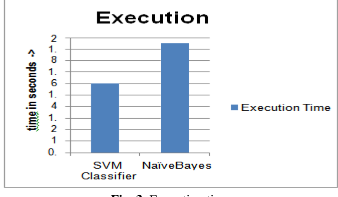
Fig. 3. Execution time

accuracy of SVM is more as compared to Naïve Bayes for the plant disease detection